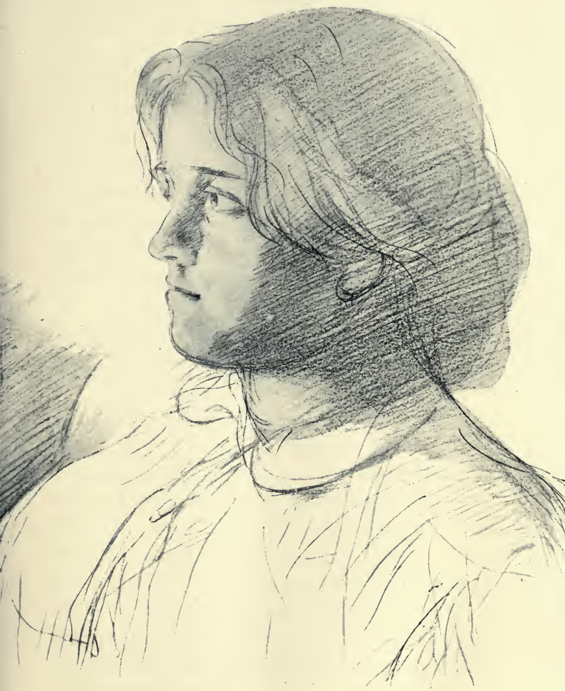
Miss Sara Allgood